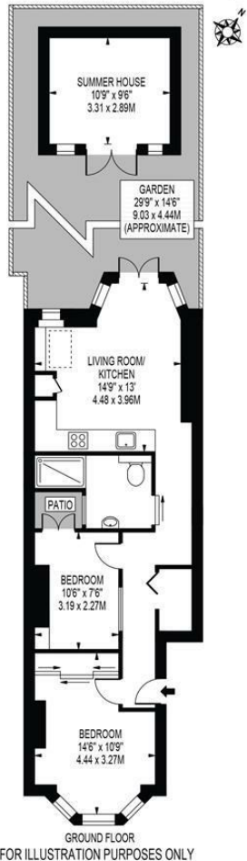
GROUND FLOOR FOR ILLUSTRATION PURPOSES ONLY

COWPER ROAD APPROXIMATE GROSS INTERNAL FLOOR AREA: 550 SQ FT - 51.09 SQ M (EXCLUDING SUMMER HOUSE) APPROXIMATE GROSS INTERNAL FLOOR AREA OF SUMMER HOUSE: 103 SQ FT - 9.57 SQ M